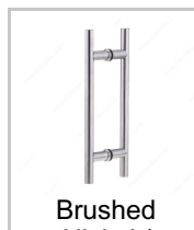
Brushed Nickel / Stainless Steel